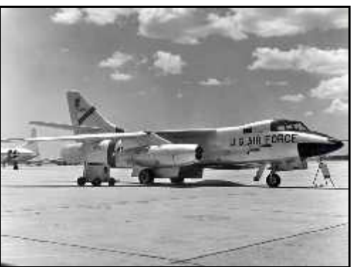
Douglas RB-66B Destroyer